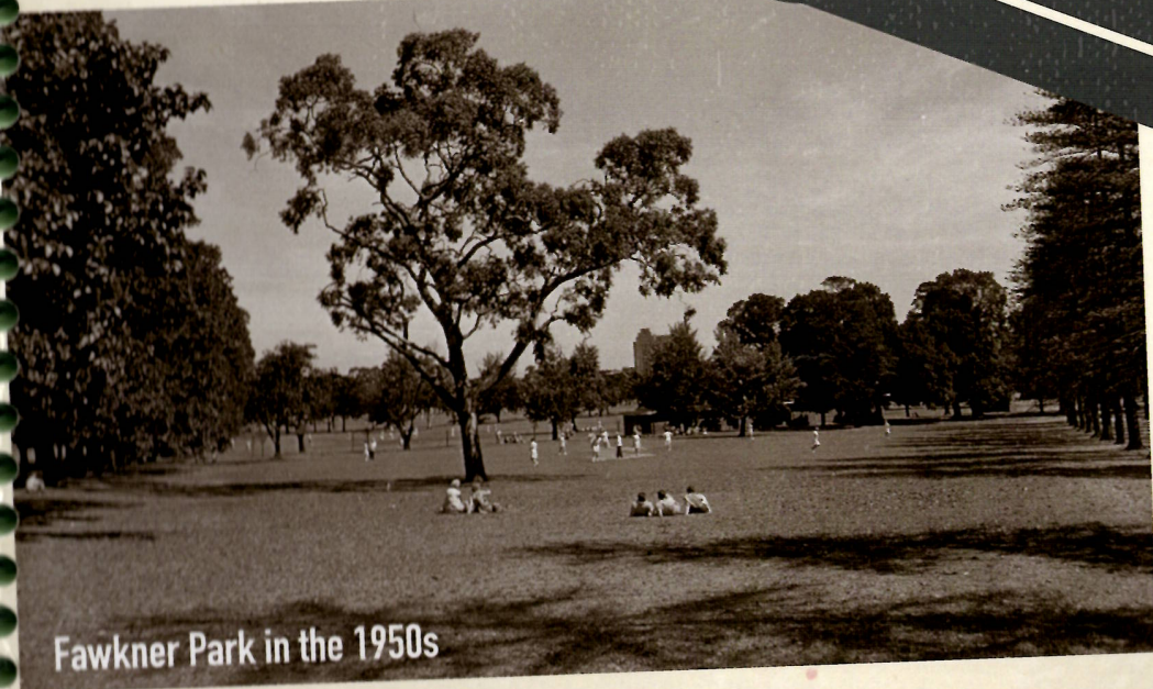
Fawkner Park in the 1950s