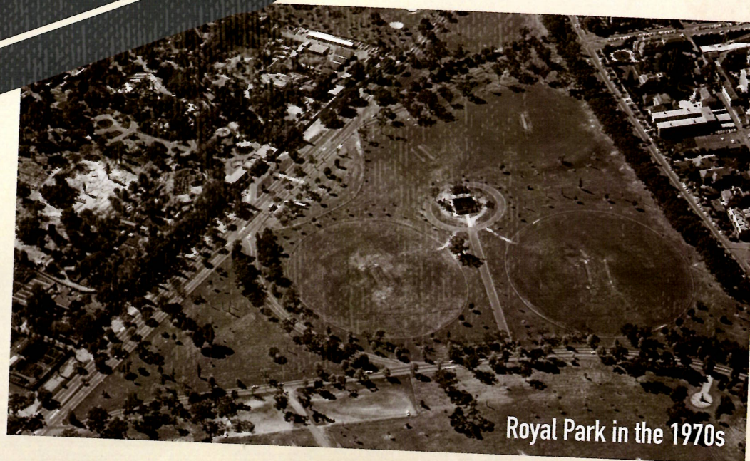
Royal Park in the 1970s