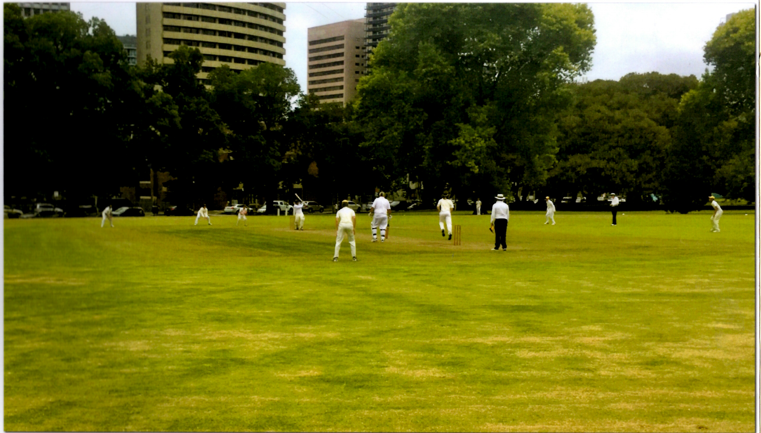
Annual Veterans versus Under-21s fixture Under-21s 4-211 d Veterans 4-cc-208 26 January 2017, Herring Reserve, South Yarra